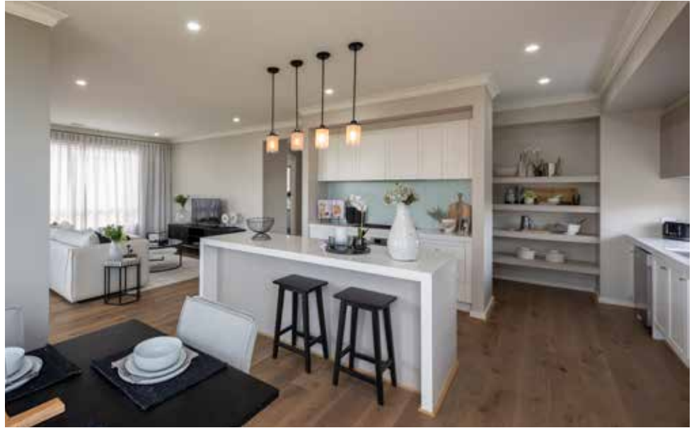
This image may contain internal or external luxury upgrade items and furniture not included in the home price.